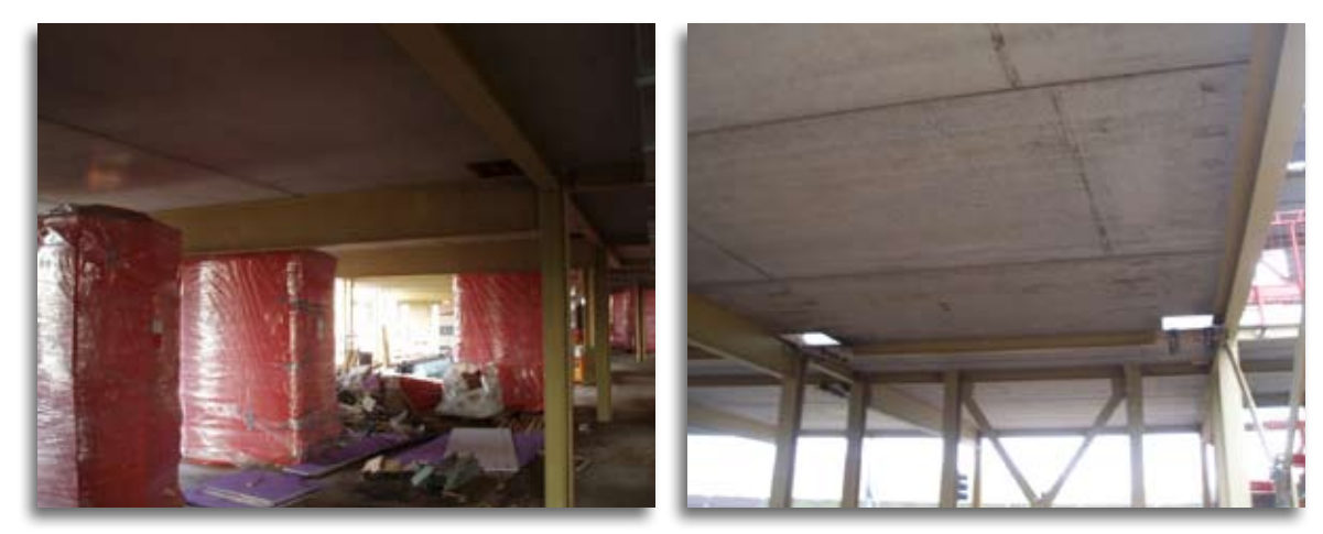
Example of pod opes on Flood Super Wideslab with trimmer beams eliminated.

There were two notable benefits from this approach. First, this equated to massive cost savings in reference to the reduced tonnage of steel required. Secondly, labour was drastically curtailed. The elimination of some 900no individual steel members shaved approximately three weeks off of the steel frame erection programme.